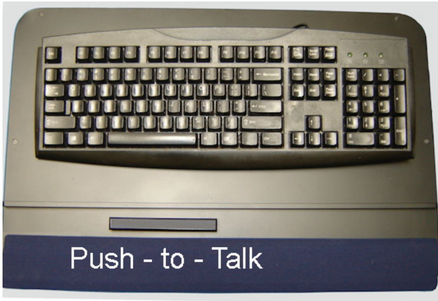
ACM 3153 PTT Keyboard

The ACM 3153 PTT Keyboard allows the operator to have the convenience of transmit PTT at the simple reach of the hand to depress the PTT bar just below the space bar on the Keyboard.