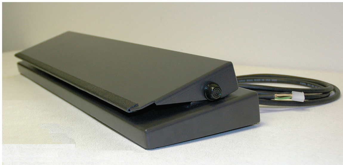
ACM 3150 Series Footswitch

The ACM 3150 series Heavy duty foot switch reduces the need for the operator to have to "Hunt" for smaller types of switches. Made of 12 gauge steel and finished in a powder coated shadow bronze or black paint, this heavy duty unit will provide superior service in the 24 / 7 dispatch environment.