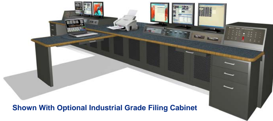
Shown With Optional Industrial Grade Filing Cabinet