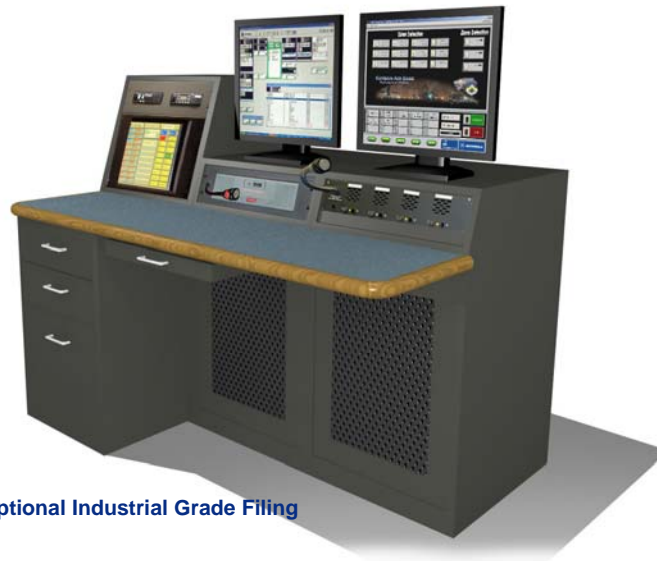
Shown With Optional Industrial Grade Filing