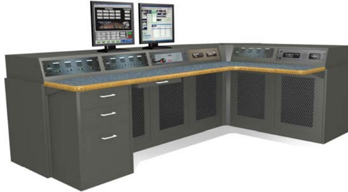
Shown With Optional Industrial Grade Filing Cabinet